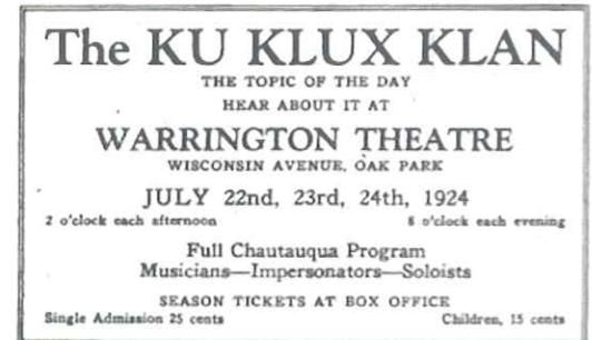
The KKK promoted its racist and xenophobic message at 6 shows in this 1,200 seat theater, advertised in the Oak Leaves

Over the years I have maintained a relationship with the OPRF Museum through continued research, membership, volunteering, serving on the Board of Directors, and bringing my students from North Park University on field trips. When I moved back to Oak Park last fall I chose to join the board of the museum. Amidst commitments to my young family and my career as an assistant professor with a ticking tenure-track clock, I decided to give some of my limited free time to serve on the board. Participation on the board affords me the opportunity to have a stake in the interpretation of some of the museum's artifacts and make sure stories like that of the Walosas Club Chapter of the Women of the Ku Klux Klan are told and discussed.